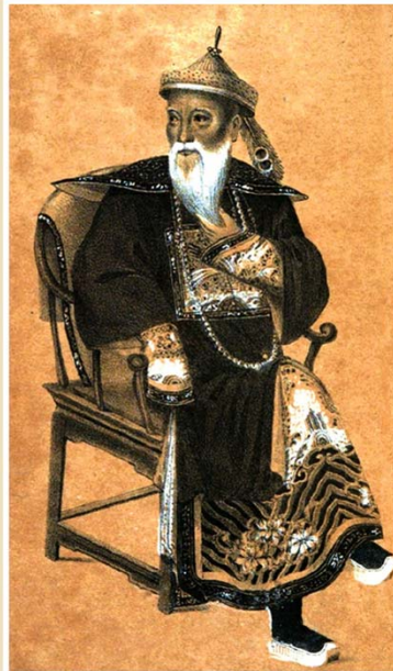
Commissioner Lin Zexu London: Richard Bentley, New Burlington Street, Publisher in Ordinary to Her Majesty, 1843), pl. ii. Chapter 19. Ways of the World: A Brief Global History , Second Edition and Ways of the World: A Brief Global History with Sources , Second Edition Copyright © 2013 by Bedford/St. Martin's Page 648 (page 940, With Sources)