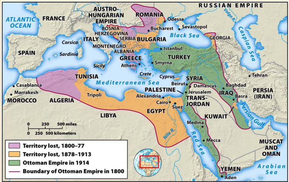
Map 19.2 The Contraction of the Ottoman Empire Chapter 19, Ways of the World: A Brief Global History, Second Edition and Ways of the World: A Brief Global History with Sources, Second Edition Copyright © 2013 by Bedford/St. Martin's Page 651 (page 943, With Sources)