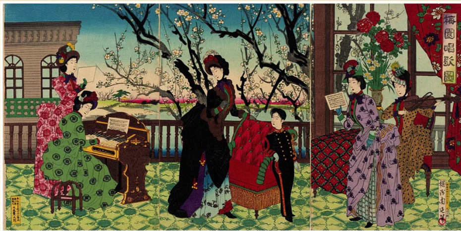
Visual Source 19.2 Women and Westernization Museum of Fine Arts, Boston, Gift of L. Aaron Lebowich, RES.53.82-4. Chapter 19, Ways of the World: A Brief Global History with Sources , Second Edition Copyright © 2013 by Bedford/St. Martin's Page 968