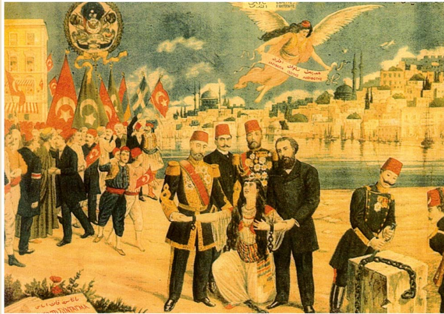
The First Ottoman Constitution "The Ottoman Constitution, December 1895," color postcard. Artist unknown Chapter 19. Ways of the World: A Brief Global History , Second Edition and Ways of the World: A Brief Global History with Sources , Second Edition Copyright © 2013 by Bedford/St. Martin's Page 654 (page 946, With Sources)