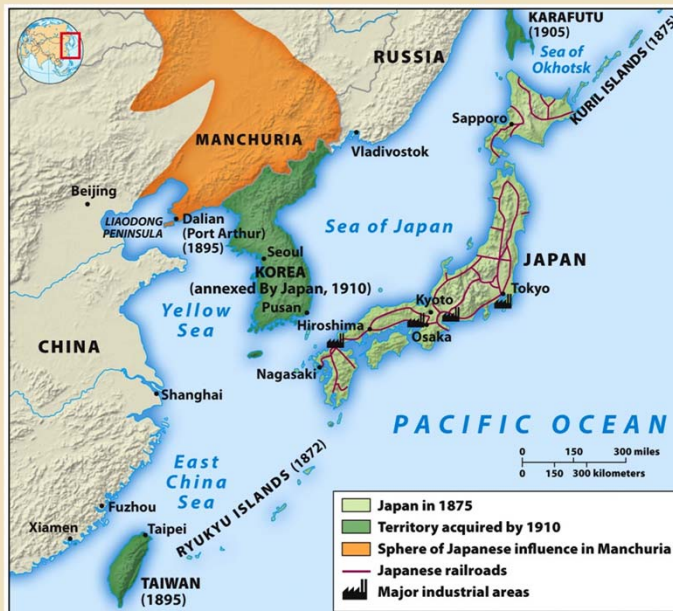
Map 19.3 The Rise of Japan Chapter 19, Ways of the World: A Brief Global History , Second Edition and Ways of the World: A Brief Global History with Sources , Second Edition Copyright © 2013 by Bedford/St. Martin's Page 663 (page 955, With Sources)