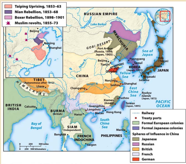
Map 19.1 China and the World in the Nineteenth Century Chapter 19, Ways of the World: A Brief Global History , Second Edition and Ways of the World: A Brief Global History with Sources , Second Edition Copyright © 2013 by Bedford/St. Martin's Page 646 (page 938, With Sources)